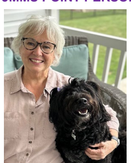
JMMS POINT PERSON